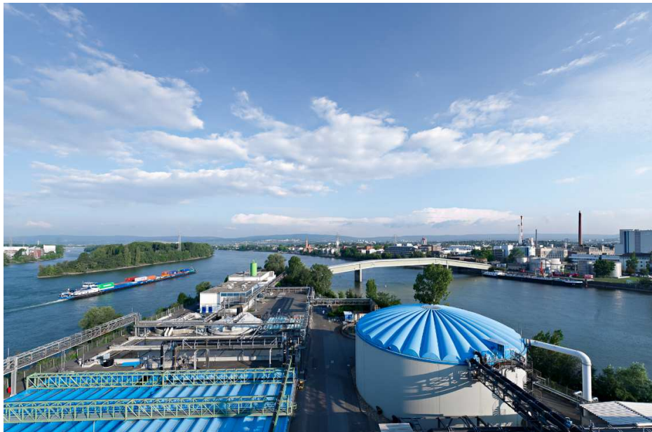
Illustration: SAMSON AKTIENGESELLSCHAFT

As part of the strategic development cooperation between SAMSON and InfraServ Wiesbaden, the two companies launched a common pilot project. The goal is to optimize the processes in the biological water treatment plant operated by InfraServ Wiesbaden on an island in the Rhine river in Kalle-Albert Industrial Park based on the UBIX platform.